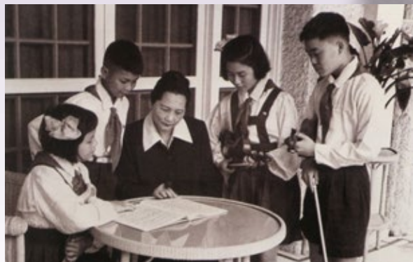
Madam Soong Ching Ling hosting orchestra members from the Children's Art Theatre at her residence