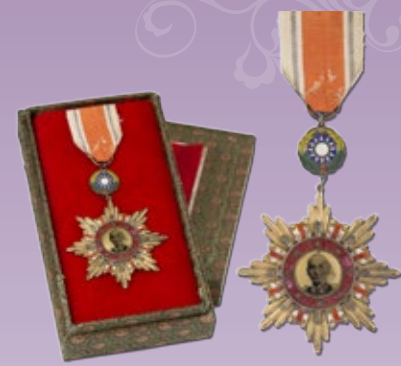
The Medal of Victory presented to Madam Soong Ching Ling by the National Government (1945)