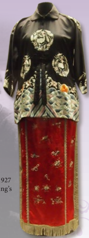
Madam Soong Ching Ling's Trousseau

This photograph was taken in 1927 during Madam Soong Ching Ling's visit to Wuhan