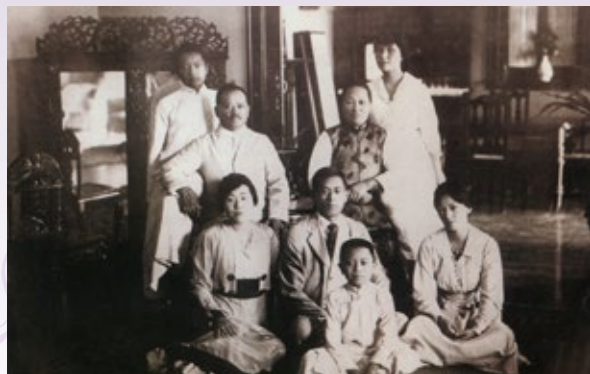
Family photograph of the Soong (1917)

The exhibition is also Sun Yat Sen Nanyang Memorial Hall's maiden collaboration with the Soong Ching Ling Memorial Residence in Shanghai. Over 134 artefacts ranging from photographs to personal belongings of Dr. Sun and Madam Soong are displayed in this special exhibition, showcasing the life journey of Madam Soong and highlighting her experiences and involvement in the major milestones in the history of China.