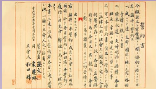
Certificate of Marriage of Dr. Sun Yat Sen and Madam Soong Ching Ling (1915)